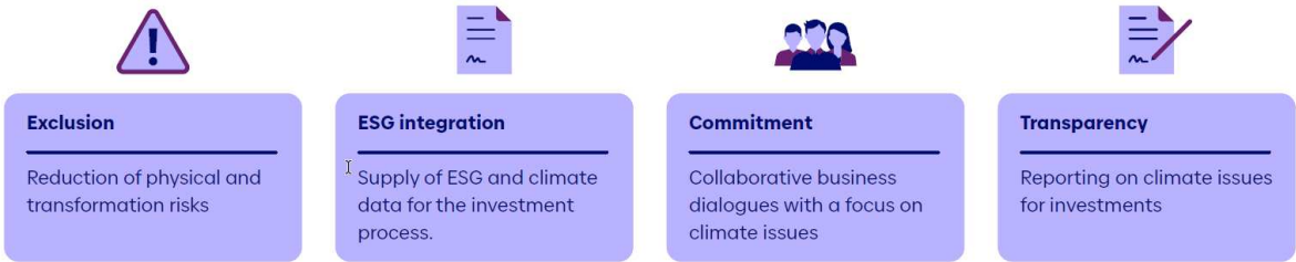
Figure 2: Four pillars of the Baloise Asset Management Climate Strategy

Our climate strategy is based on the four strategic pillars and forms an integral part of the general RI strategy and, therefore, of this policy: